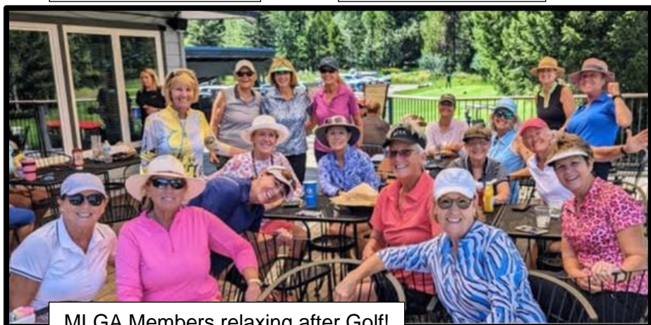
MLGA Members relaxing after Golf!