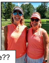
Is Anyone Seeing Double??